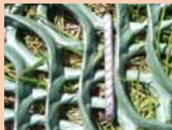
Secured with U-pins