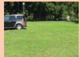
After installation - grass grows through quickly