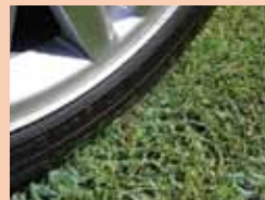
Mesh after installation