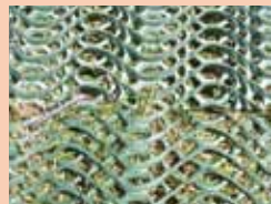
Mesh 'Butt' joined using U-pins